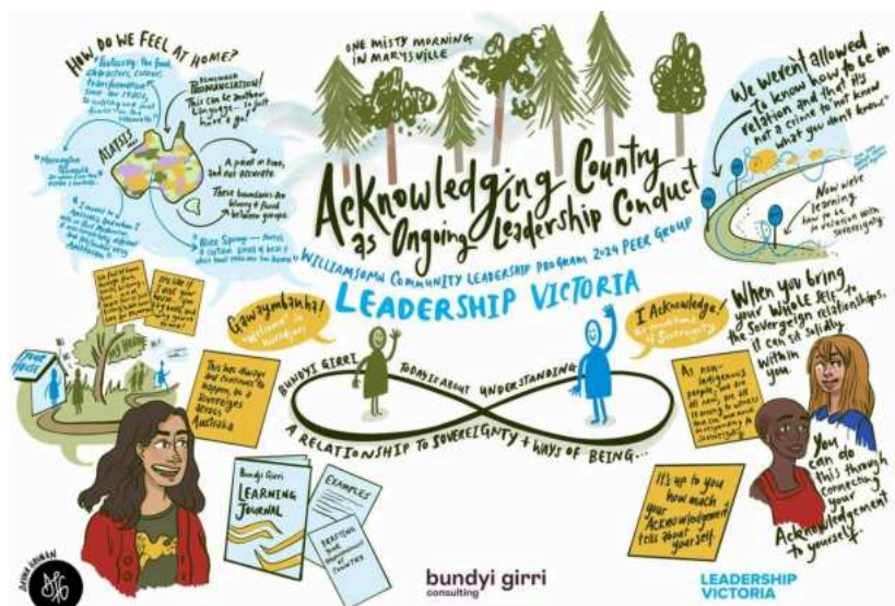
A visual representation of the the 2024 WCLP Bundyi Girri Workshop.