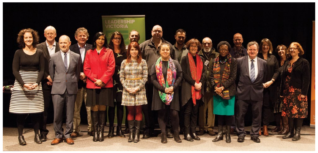
LV Mentors at the graduation of the New & Emerging Communities Leadership Program, Melbourne.