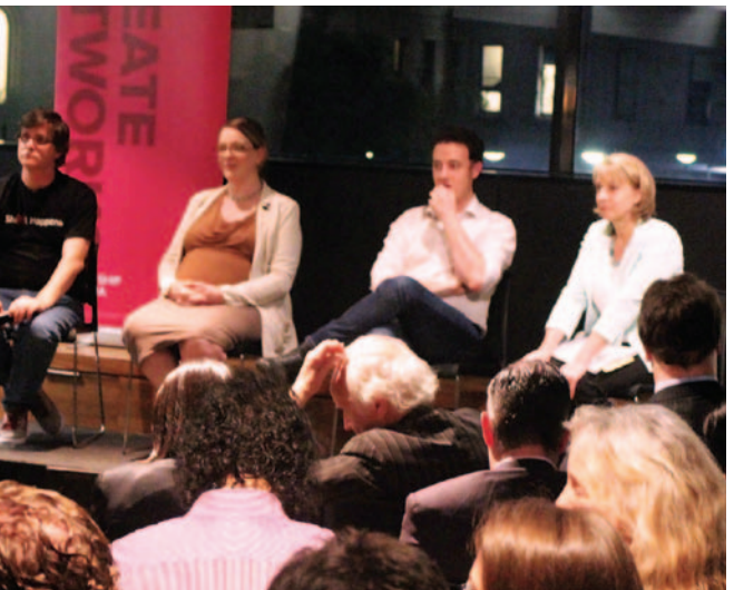
Our expert panel at the Leadership In the Digital Age (LIDA) event held at The Age.